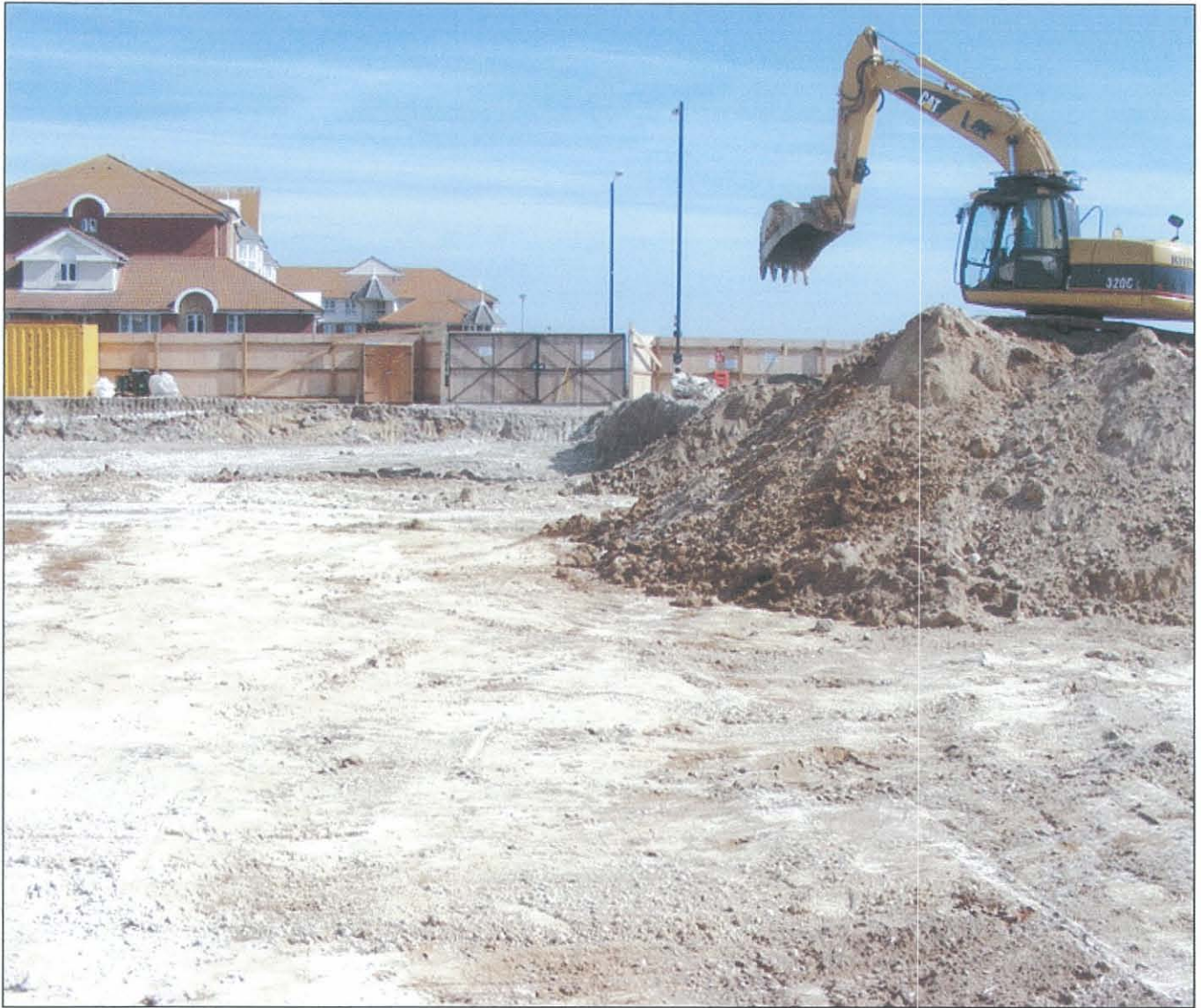
Figure 3. Facing north. Removing piled demolition material from previous buildings on site. The Upper Chalk surface is truncated as can be seen by the demolition/building debris overlaying the Chalk surface.