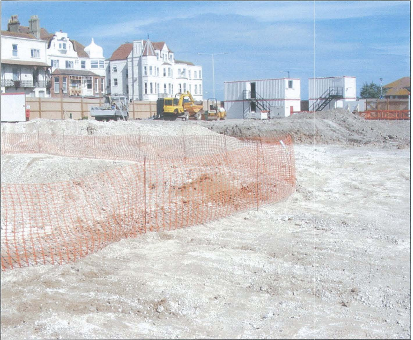
Figure 4. Facing north-west. The remains of a deep cellar on the left and the layers of demolition / building material overlaying the truncated Chalk.