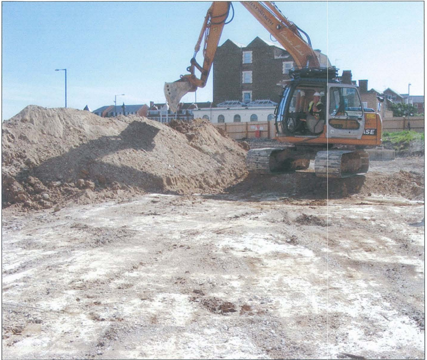
Figure 2. Facing east. Removing made up ground with a toothless bucket to reveal the truncated surface of the Upper Chalk. No archaeological remains were revealed on site.