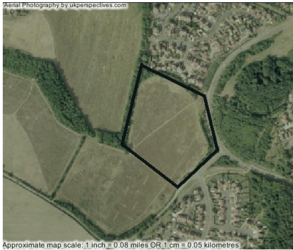
Figure 2. Aerial Photograph showing location of the Proposed Development Area.