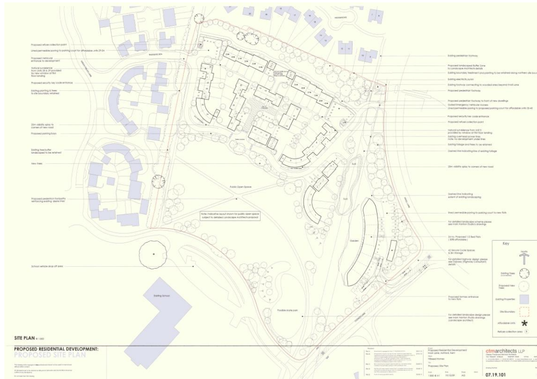
Figure 1. Plan of the Proposed Development site.