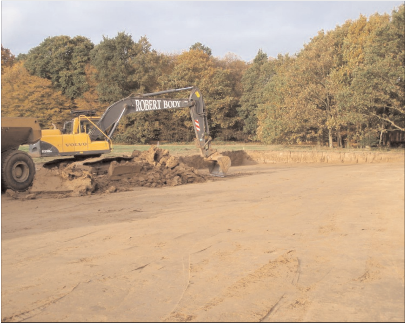
Plate 2. Showing excavated area for foundations for proposed Poultry House (facing west)