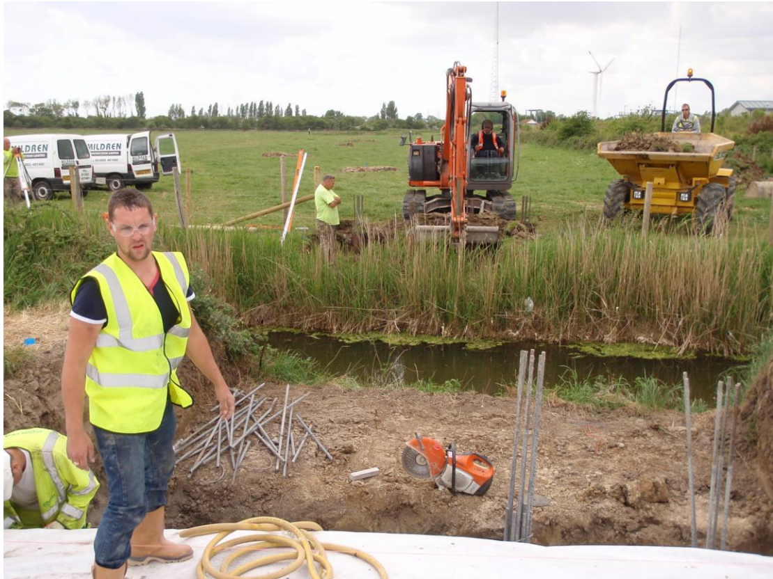
Plate 1. View of bridge site looking north-west