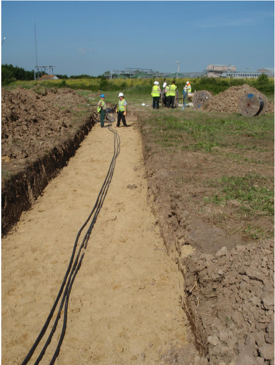
Plate 2. Main cable run at a depth of about 50-55cm