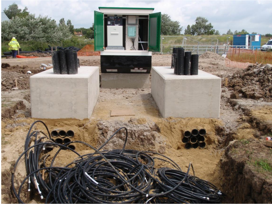
Plate 3. Inverter building, depth of construction about 55cm