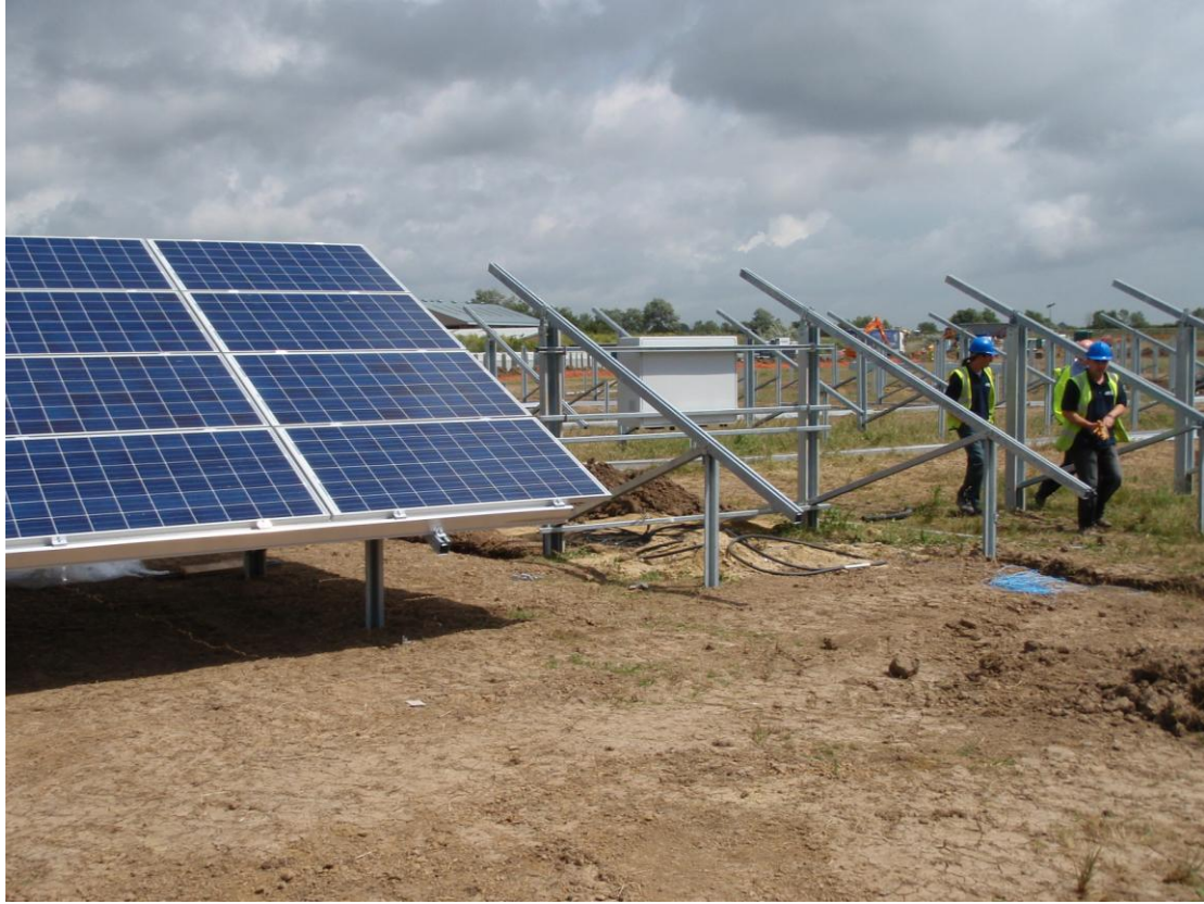
Plate 4. Solar arrays