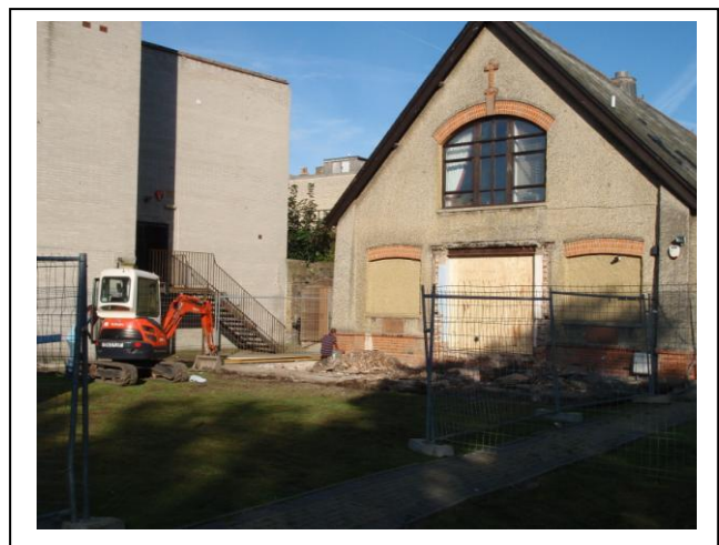
Plate 2. (right) View of development site.