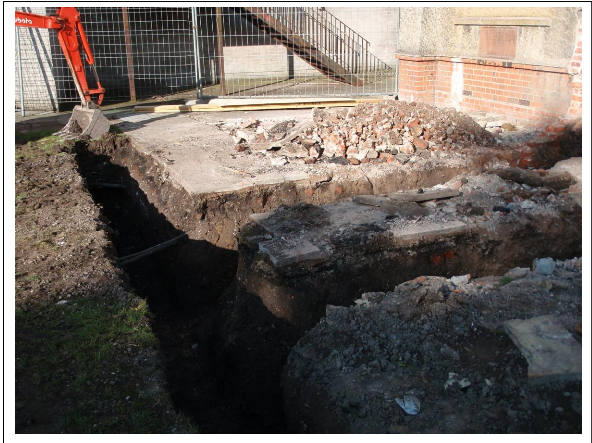
Plate 1. (above) View of the foundation trenches.