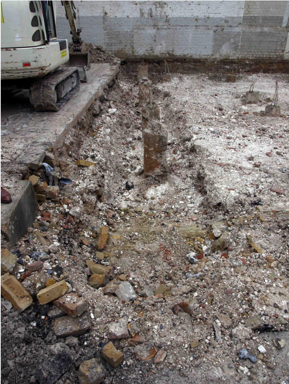
Plate 3. Removal of previous building slab and extent and depth of excavation