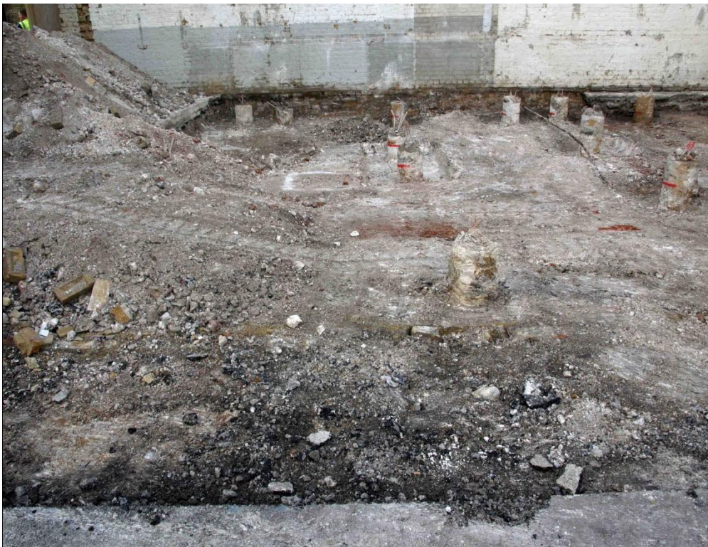
Plate 1. View of site