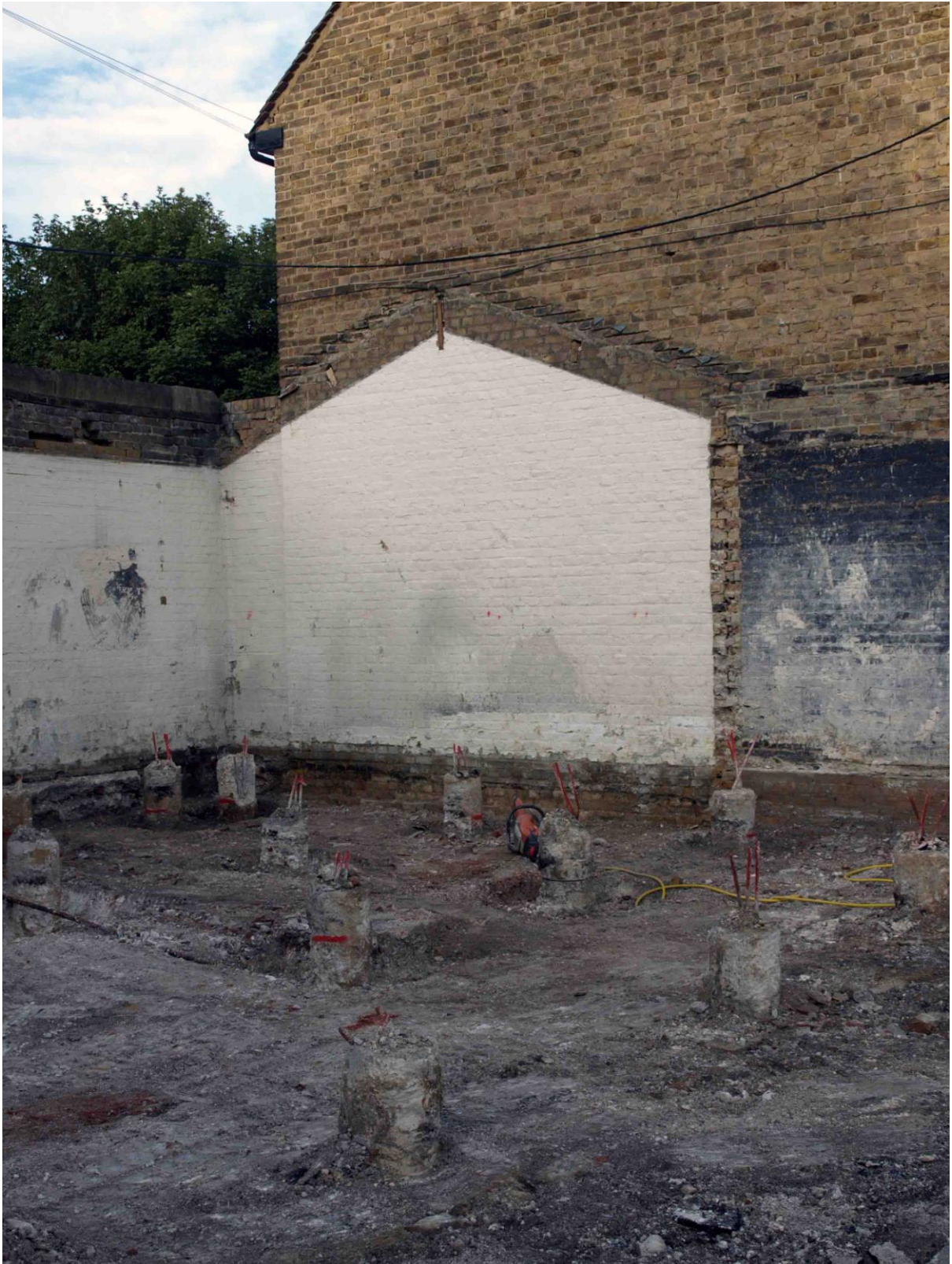
Plate 2. General view of site