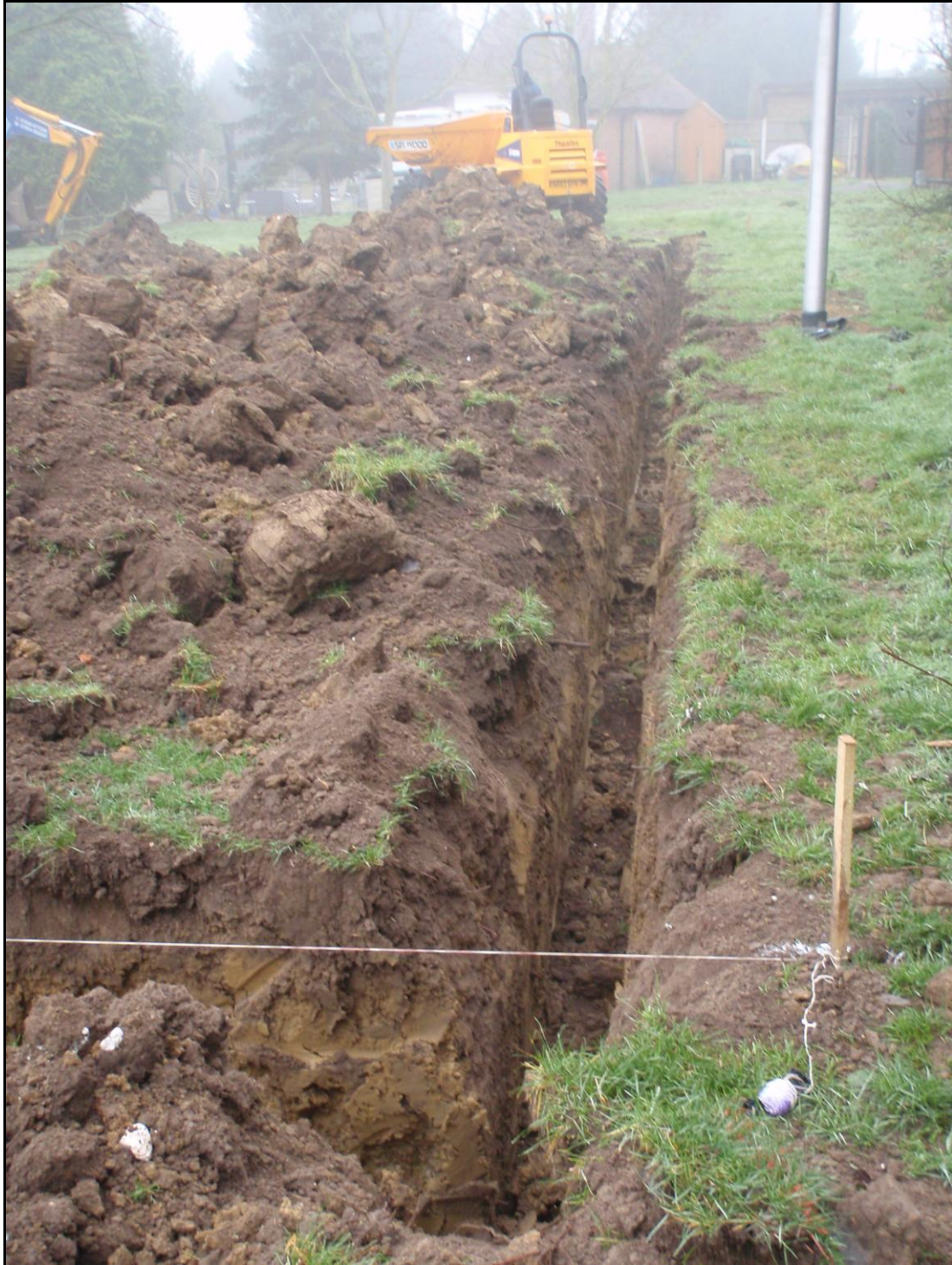
Plate 1. Showing natural geology and foundation trenches (Phase 1) for new stables