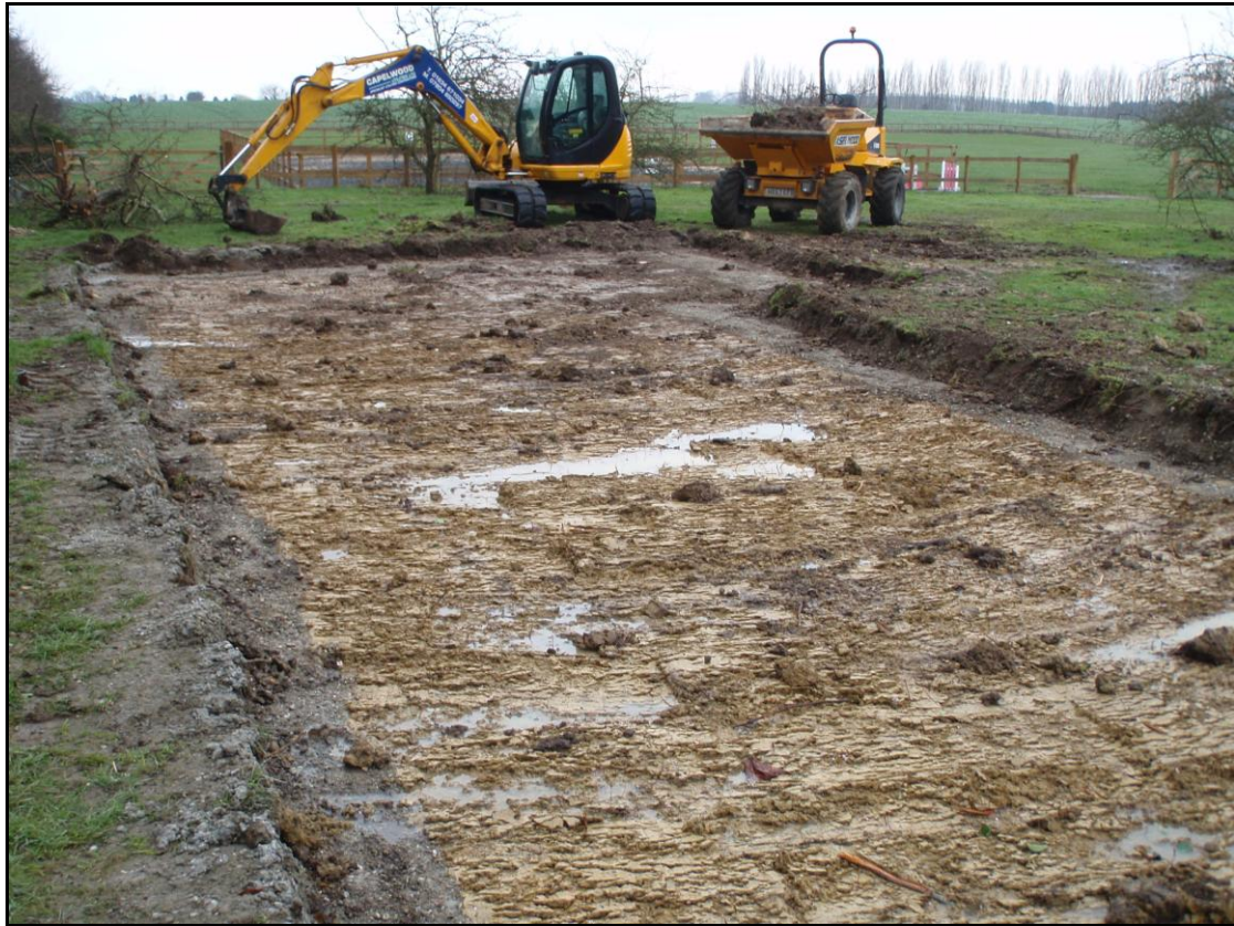
Plate 2. Showing soil strip (Phase 2) prior to construction of the stables concrete base (facing north)