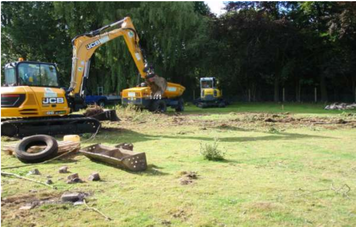
Plate 2. General view of site, facing south-west