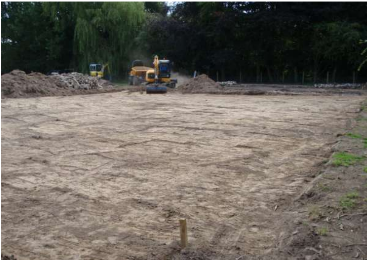
Plate 5. Completed site strip, facing south-east