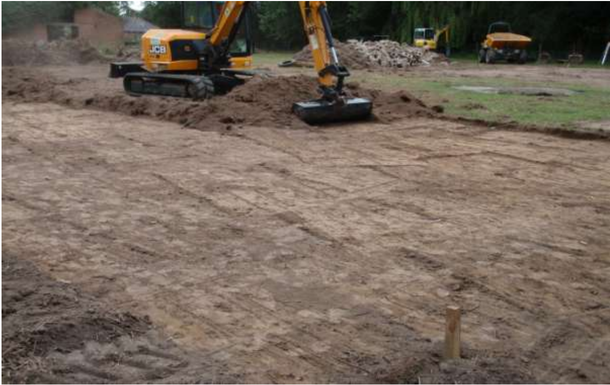
Plate 4. General view of site strip, facing south-east