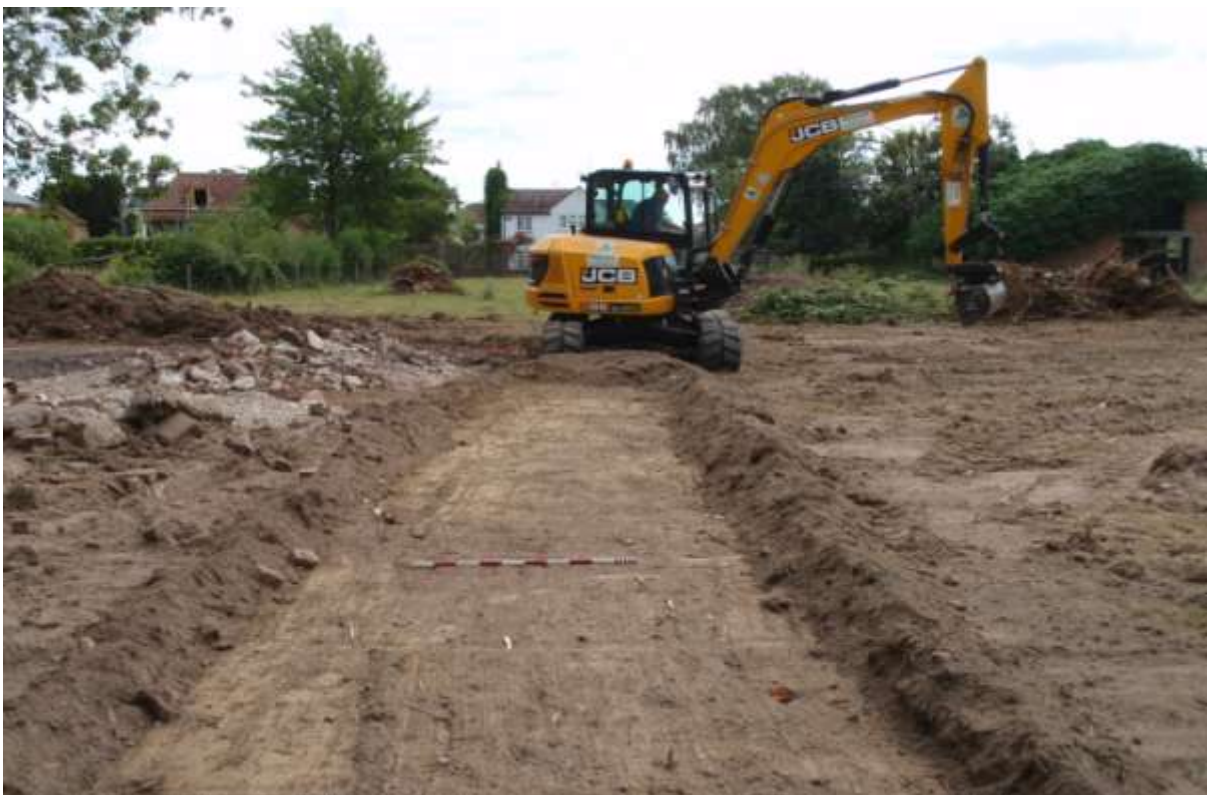
Plate 3. General view of site strip, facing east