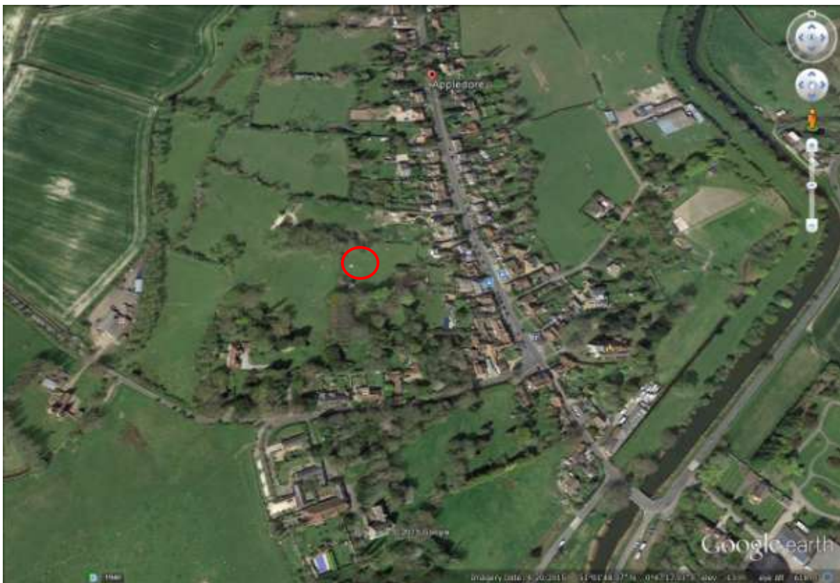
Plate 1. Aerial view of site (red circle) showing the site prior to development.

(Google Earth 20/4/2015: Eye altitude 618m).